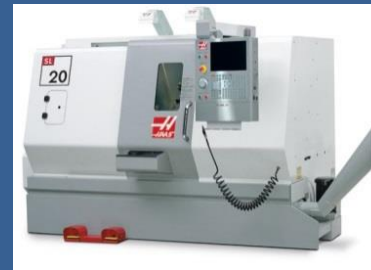
Haas SL-20 CNC Lathe