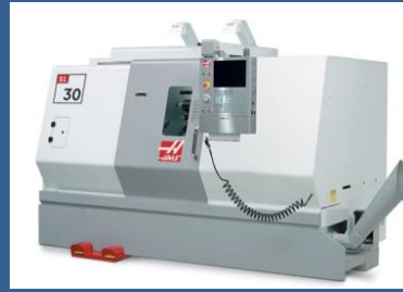
2 - Haas SL-30 CNC Lathes