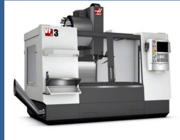
Haas VF-3 VMC Mill